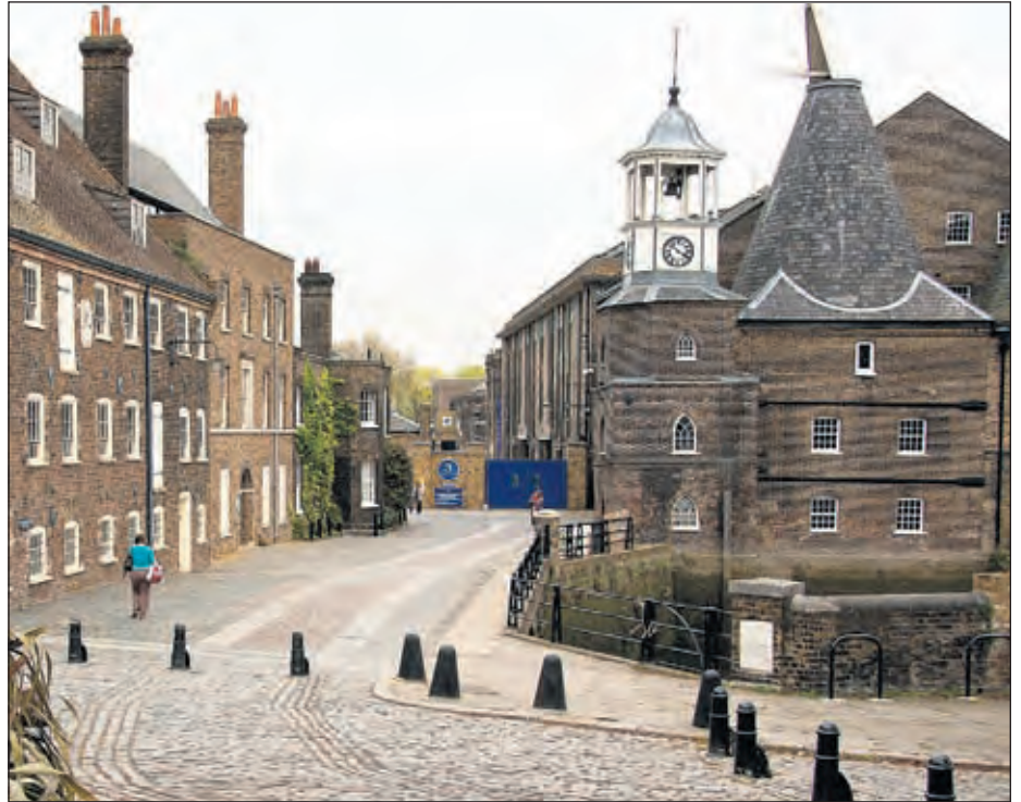
Time stands still in Three Mills Island

Just beyond the three-tier marina office, walk over the first metal footbridge across the channel leading to the Thames. Continue around the dockside, passing the headquarters of the Cruising Association. At the next corner, head right, underneath