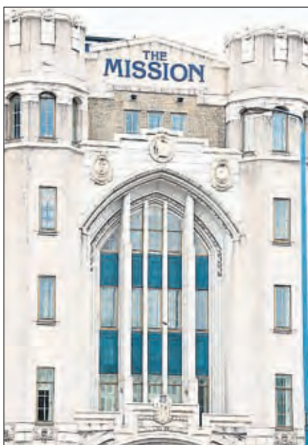
The imposing facade of The Mission

Slope down to the foot subway underneath the Blackwall Tunnel Northern Approach. On the far side, turn left up steps and follow the roadside pavement to reach Bromley-by-Bow underground station, the end of our walk.