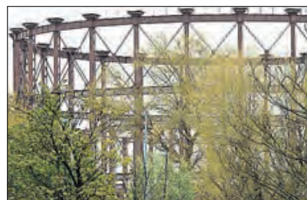
Gasholder in Twelve Trees