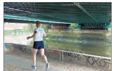
The bridge over the River Lee