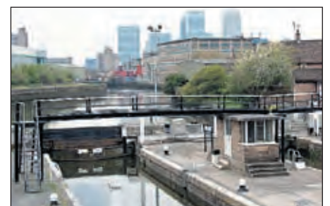
Bow Locks was built to avoid the tides