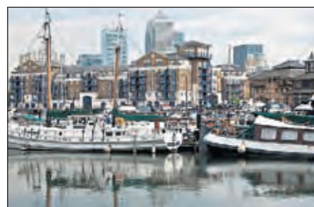
Boats moored in the Limehouse Basin