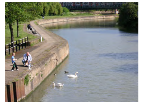
Feed the swans, geese and ducks on the Lee Navigation.