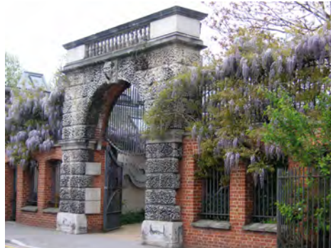
Stroll through the Northumberland House archway, now at the Bromley-by-Bow Centre.