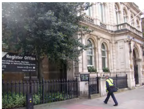
Nip through the gardens by Tower Hamlets Register Office, previously Bromley Public Hall.