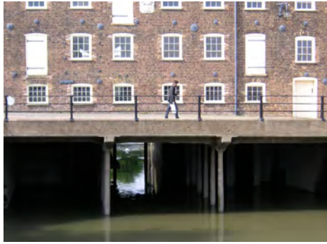
Peer under the House Mill – built in 1776 – to see the millstream flowing underneath.