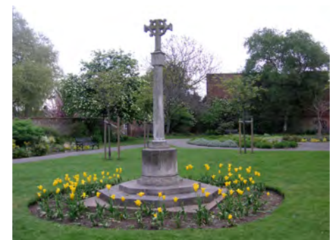
Pause for a moment in the memorial garden, adjacent to Grove Hall Park.