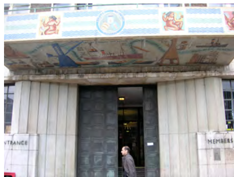
Look up to the decorative mosaics and murals on the former Poplar Town Hall.