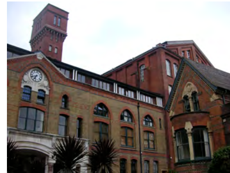
Peer between railings to the old Bryant & May match factory, now Bow Quarter.