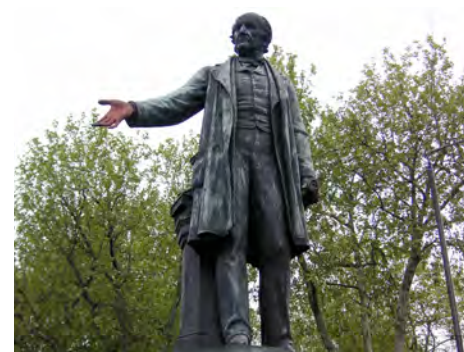
Meet Gladstone, four times Liberal Prime Minister, by St Mary's Church.