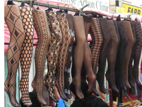
Shop for a bargain at the market stalls on Roman Road.