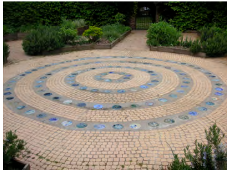
Potter around the circular gardens and explore the sculptures in Bob's Park.