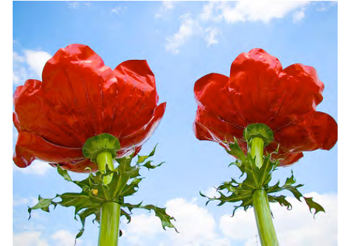
Stroll by these colossal red metal flowers, standing proud in Lefevre Park.