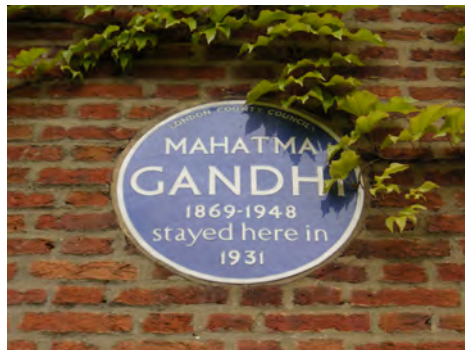
Spot the Kingsley Hall plaque to Gandhi, political and spiritual leader during India's independence.